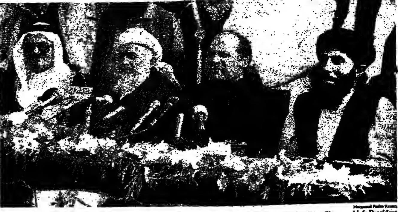
Meeting reporters after the signing of the Afghan accord were, from left, Prince Turki al Faisal, the Saudi intelligence chief; President Burhamuddin Rabbani of Afghanistan; Prime Minister Nawaz Sharif of Pakistan and Gulbuddin Hekmatyar, an Afghan leader.